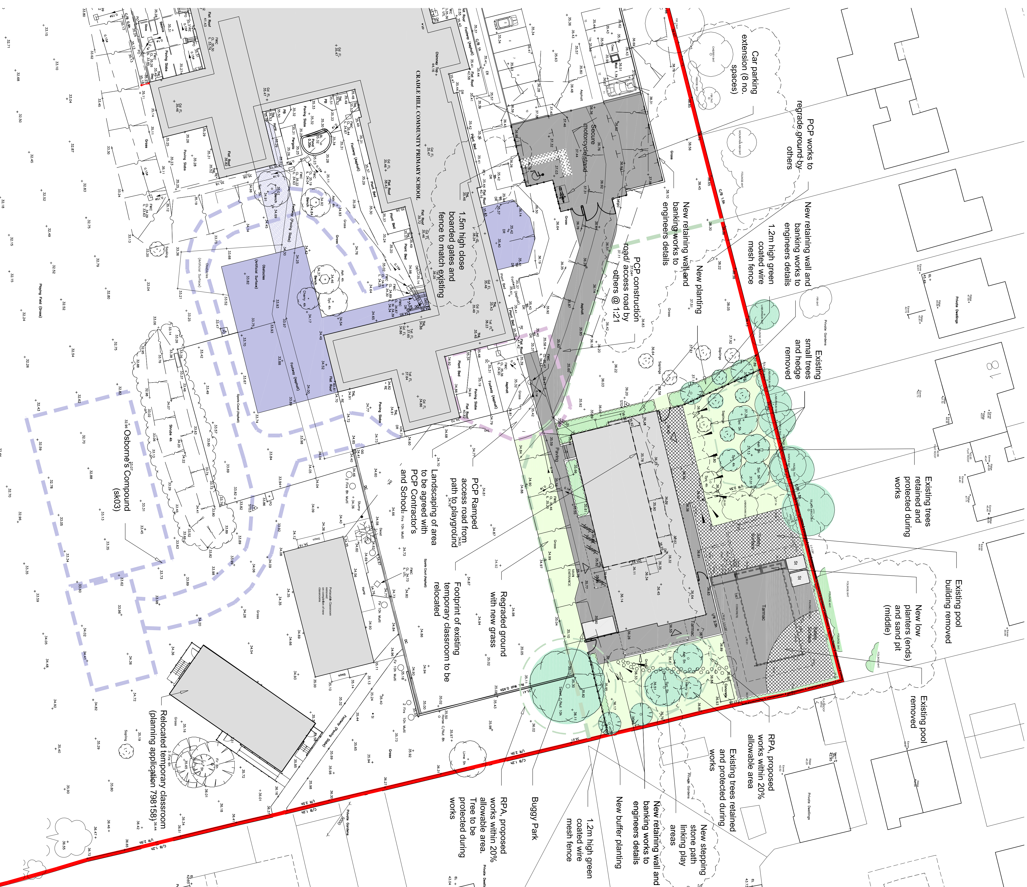
BLOCK PLAN 1:250